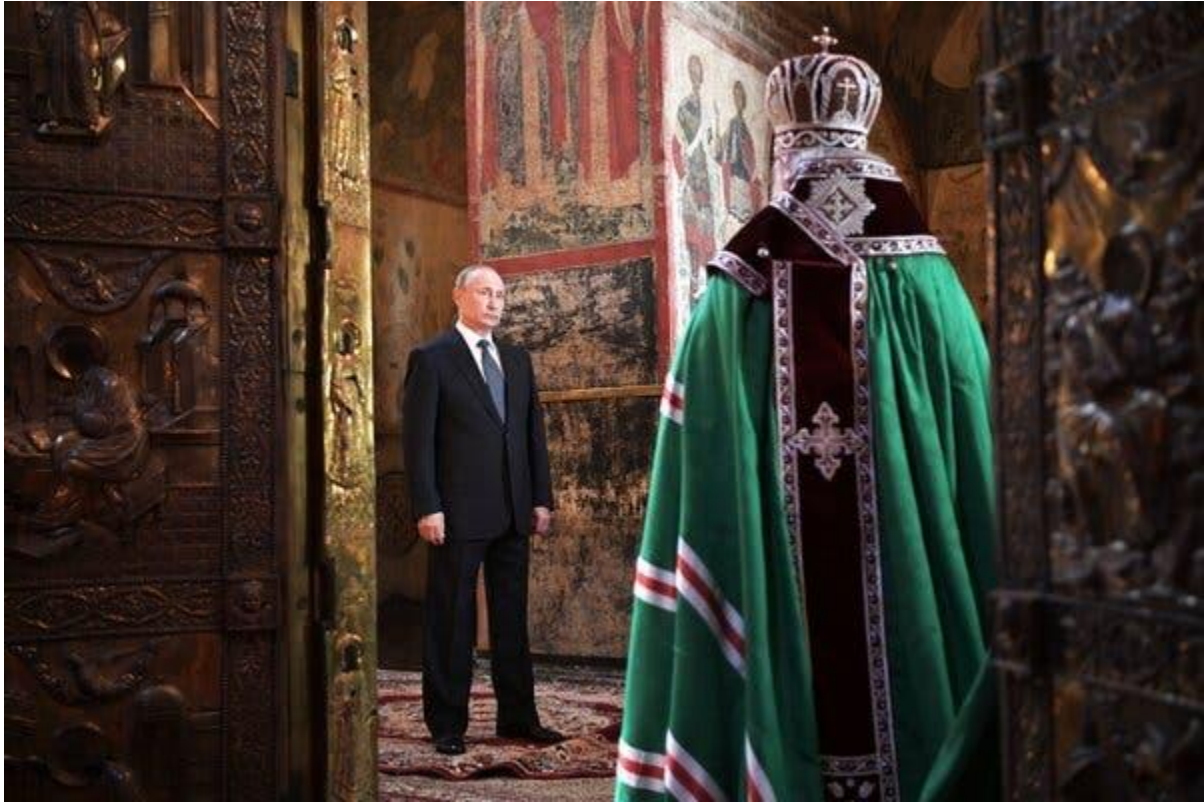
Mr. Putin has refashioned himself as a champion of Orthodox Christianity.