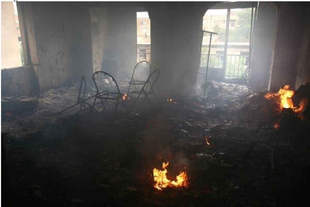
An apartment in Gori, Georgia, after it was hit by a Russian shell.