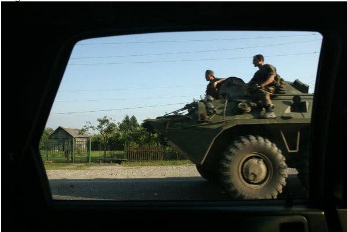
A Russian armored personnel carrier rolled through Senaki, Georgia, in August 2008.