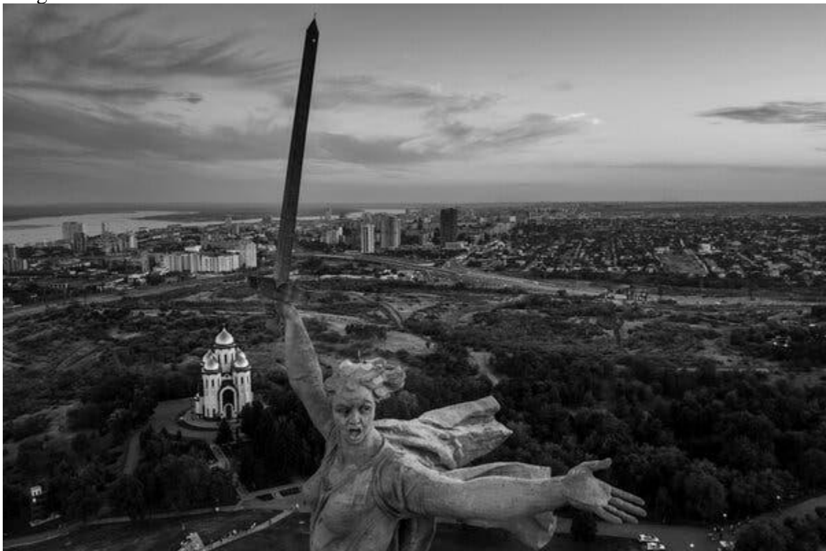
The Motherland Calls, a statue in Volgograd, Russia, commemorates soldiers killed in the Battle of Stalingrad.