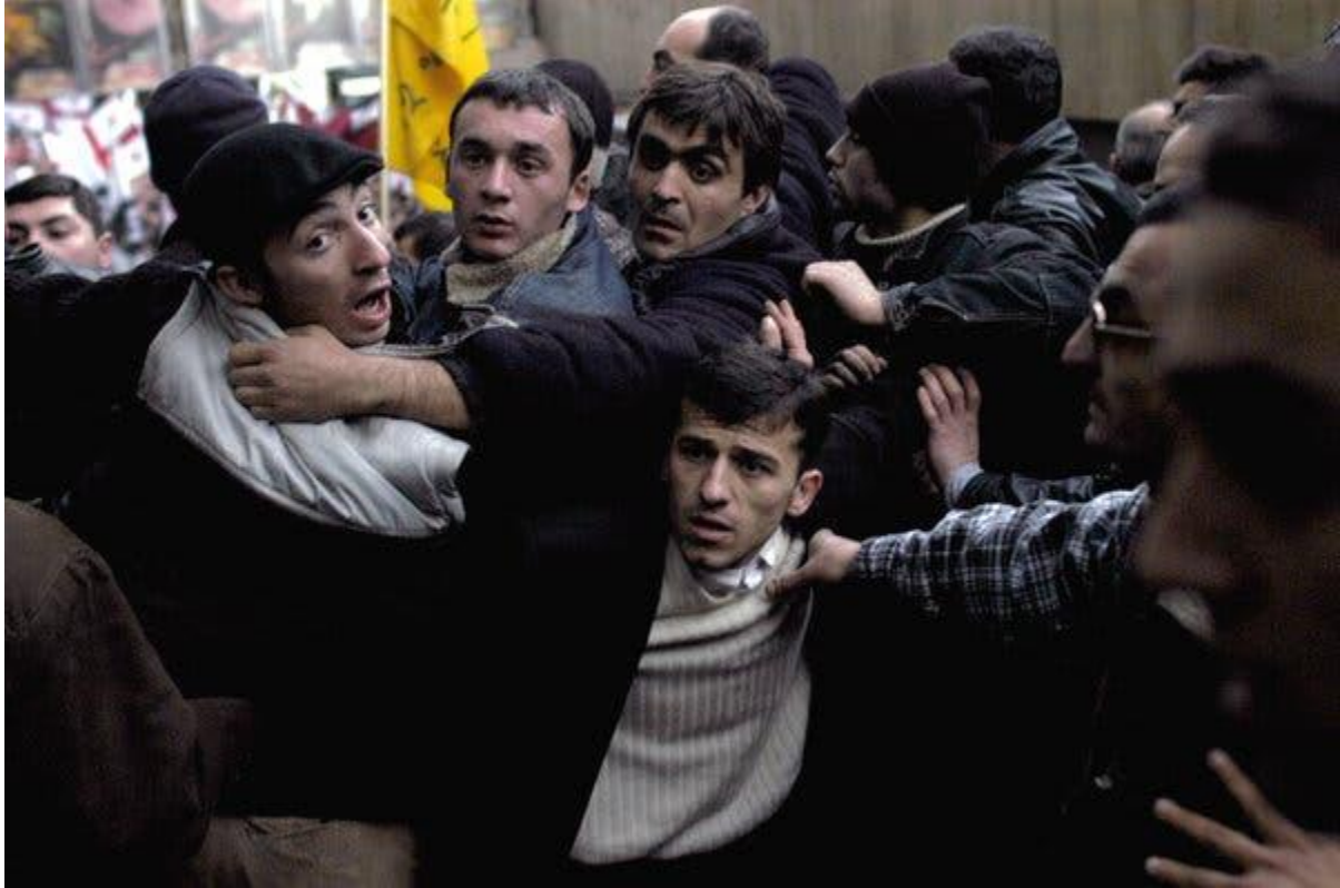
A demonstration in Tbilisi, Georgia, in November 2003. Georgia's tilt toward the West angered Mr. Putin.