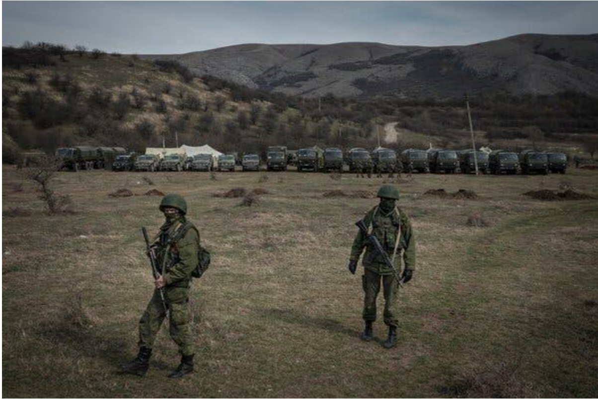
Masked Russian soldiers appeared in Crimea before Russia seized it from Ukraine in March 2014.