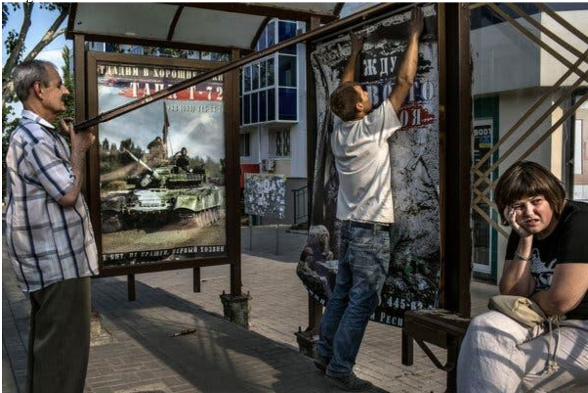
Putting up recruitment posters in 2014 for the Russian-backed separatist forces in Donetsk in eastern Ukraine.