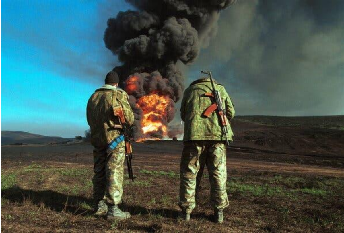
Russian soldiers watched an oil well burn in northern Chechnya in late 1999.

When asked about his methods, the president bristled, suggesting America could not claim any moral high ground. “We have a proverb in Russia,” he said. “One should not criticize a mirror if you have a crooked face.”