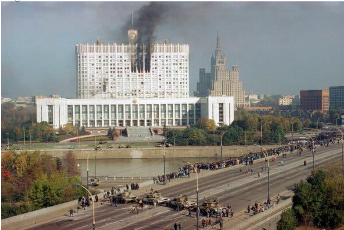
In 1993, Boris Yeltsin, Mr. Putin's predecessor, ordered Russia's Parliament shelled to put down an insurgency.