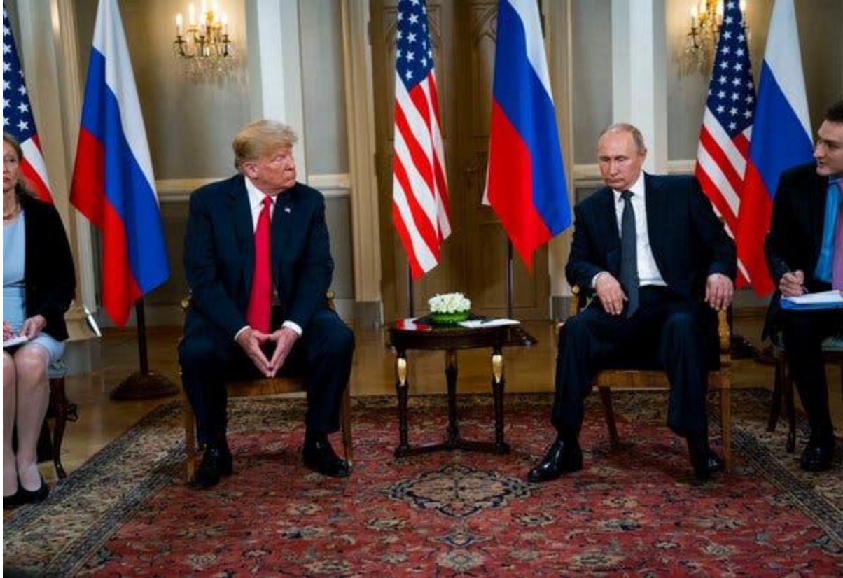
Then-President Donald J. Trump with Mr. Putin in Helsinki, Finland, in 2018.