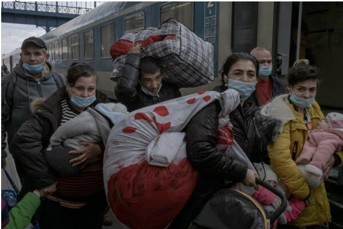
A refugee family from Ukraine arriving at a train station in Budapest this month.