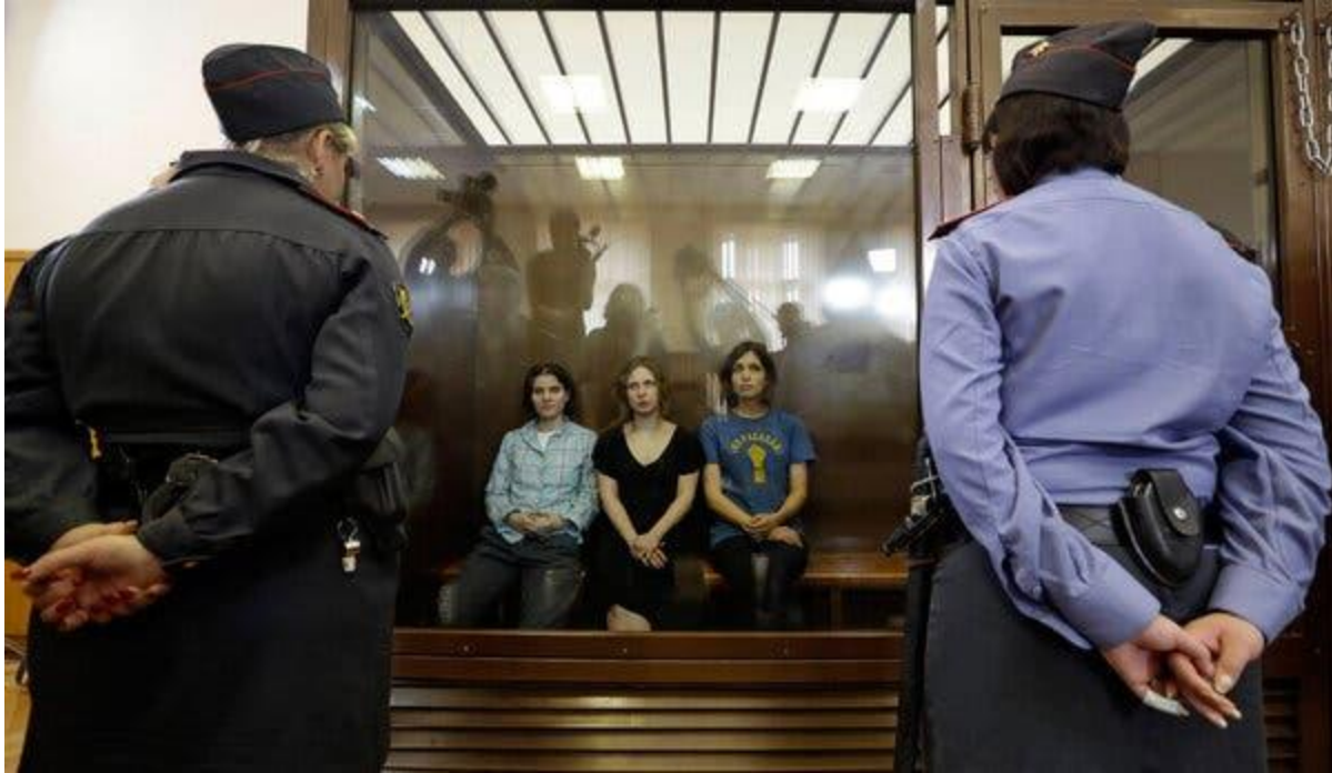
Members of the activist group Pussy Riot in a Moscow courtroom in 2012.

The United States and its allies, in Mr. Putin's telling, were intent on globalizing these subversive values under cover of democracy promotion and human rights. Saint Russia would stand against this baleful homogenization. Putinism, as it was now fleshed out, stood against a godless and insinuating West. Moscow had an ideology once more. It was one of conservative resistance, and it appealed to rightist leaders across Europe and beyond.