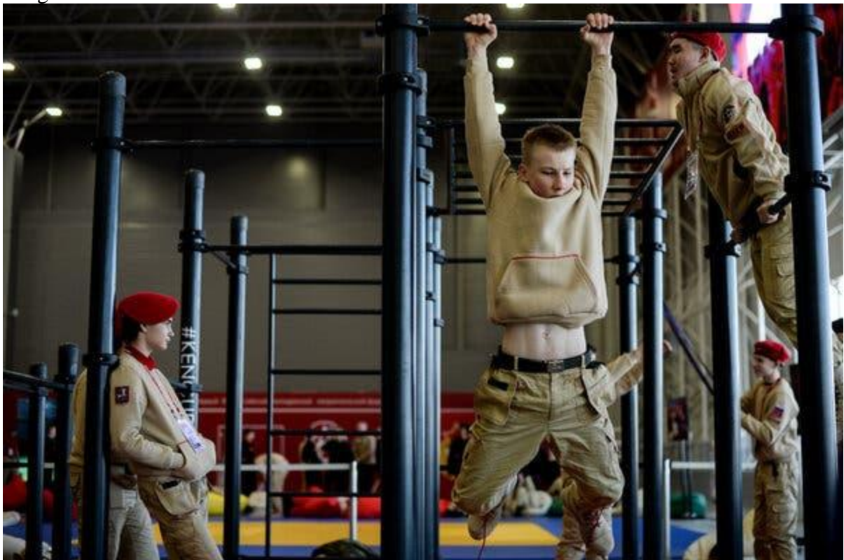
Russian military cadets training in 2018.