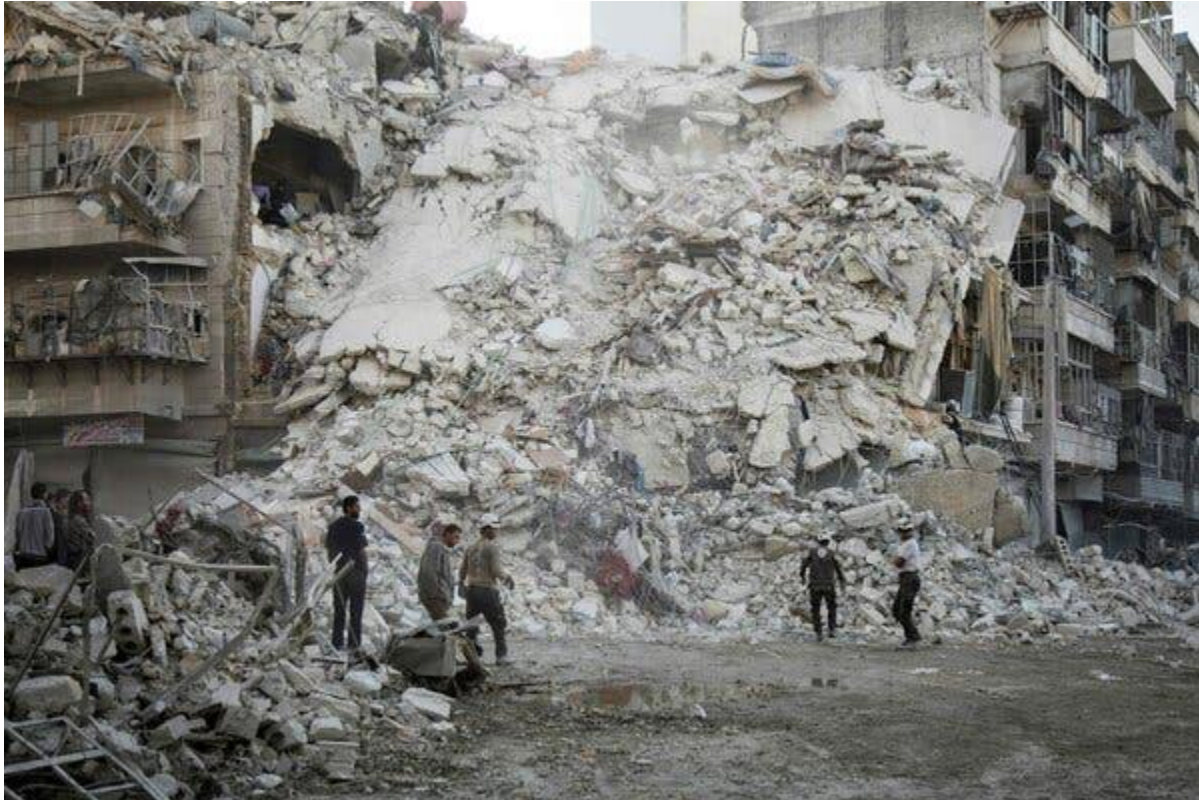
A building destroyed by air strikes in Aleppo, Syria, in October 2016.