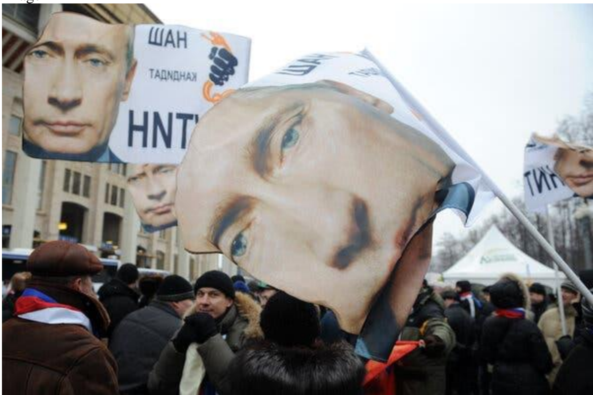
Supporters of Mr. Putin in Moscow in February 2012.