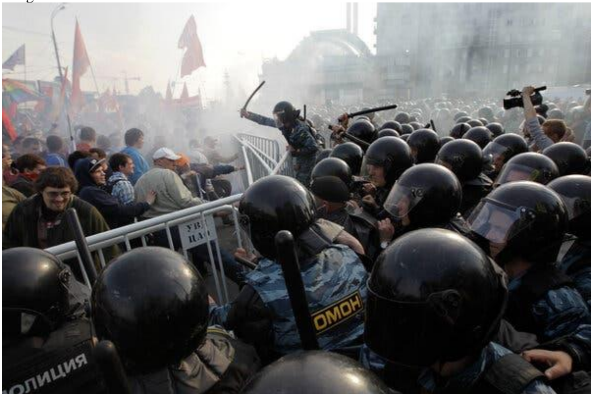
Riot police dispersed demonstrators in downtown Moscow protesting Mr. Putin's return to the presidency in May 2012.