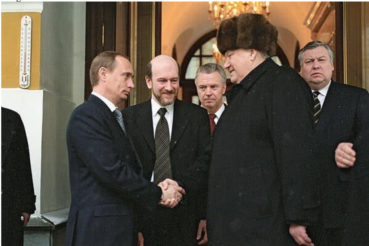
Mr. Putin, then the prime minister, with Mr. Yeltsin as he left the Kremlin in 1999.