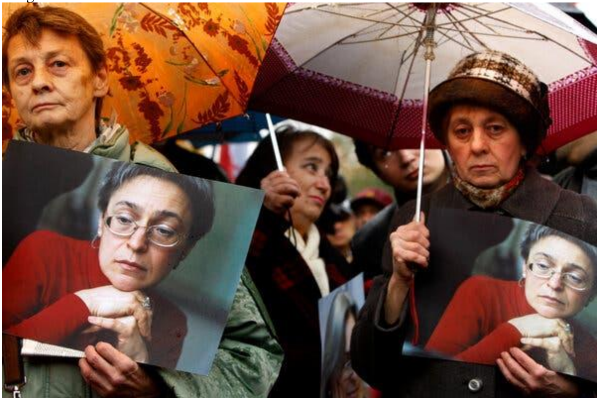
A memorial service in 2007 commemorating the first anniversary of the slaying of the Russian journalist Anna Politkovskaya.