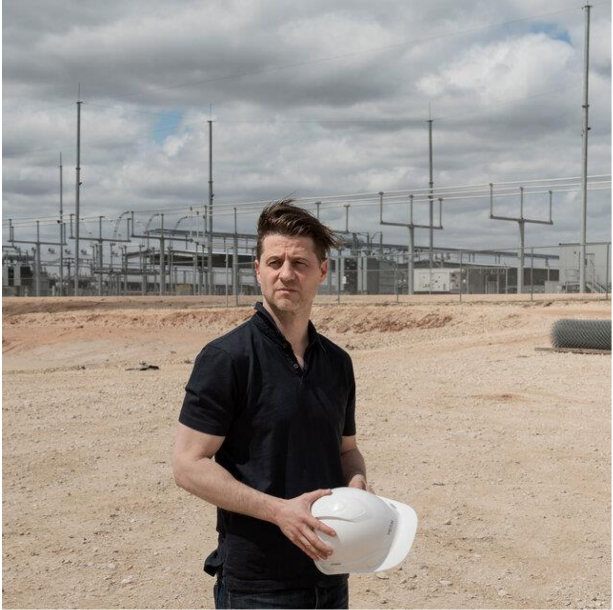
Ben McKenzie Would Like a Word With the Crypto Bros