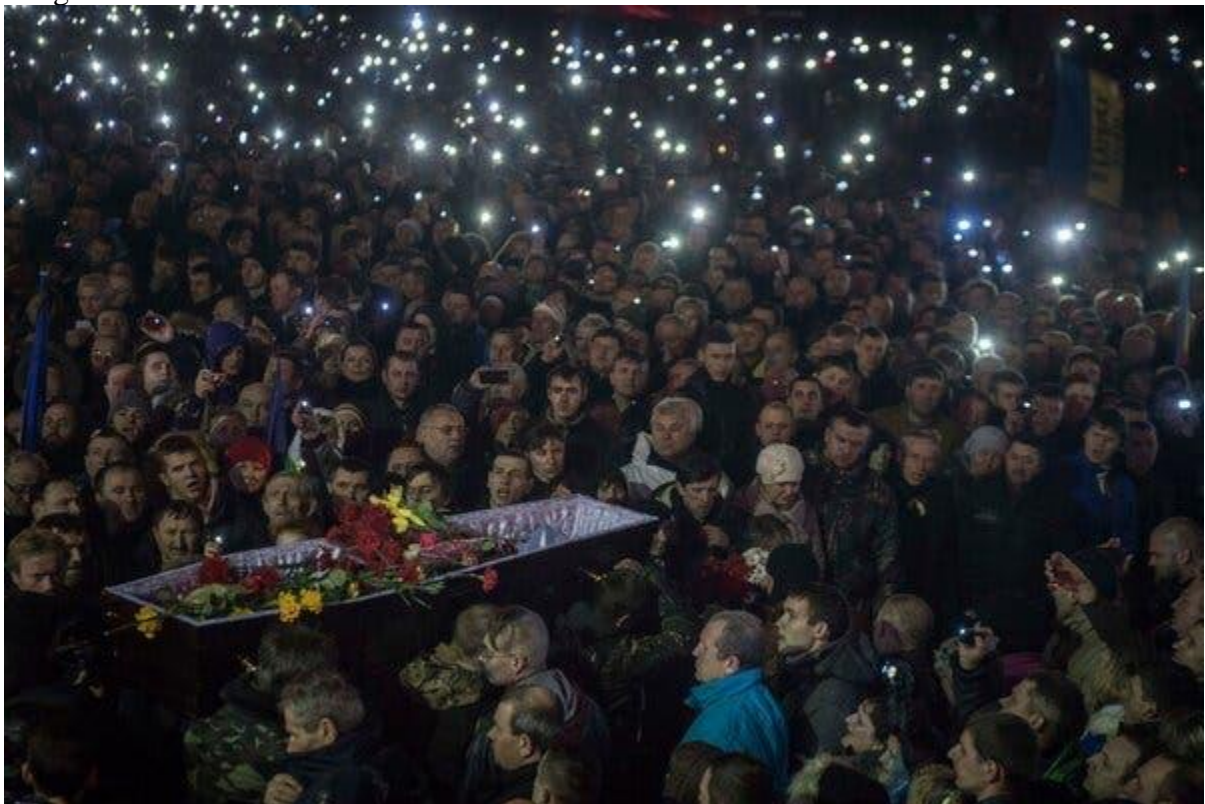
A protester's funeral in Kyiv in 2014.