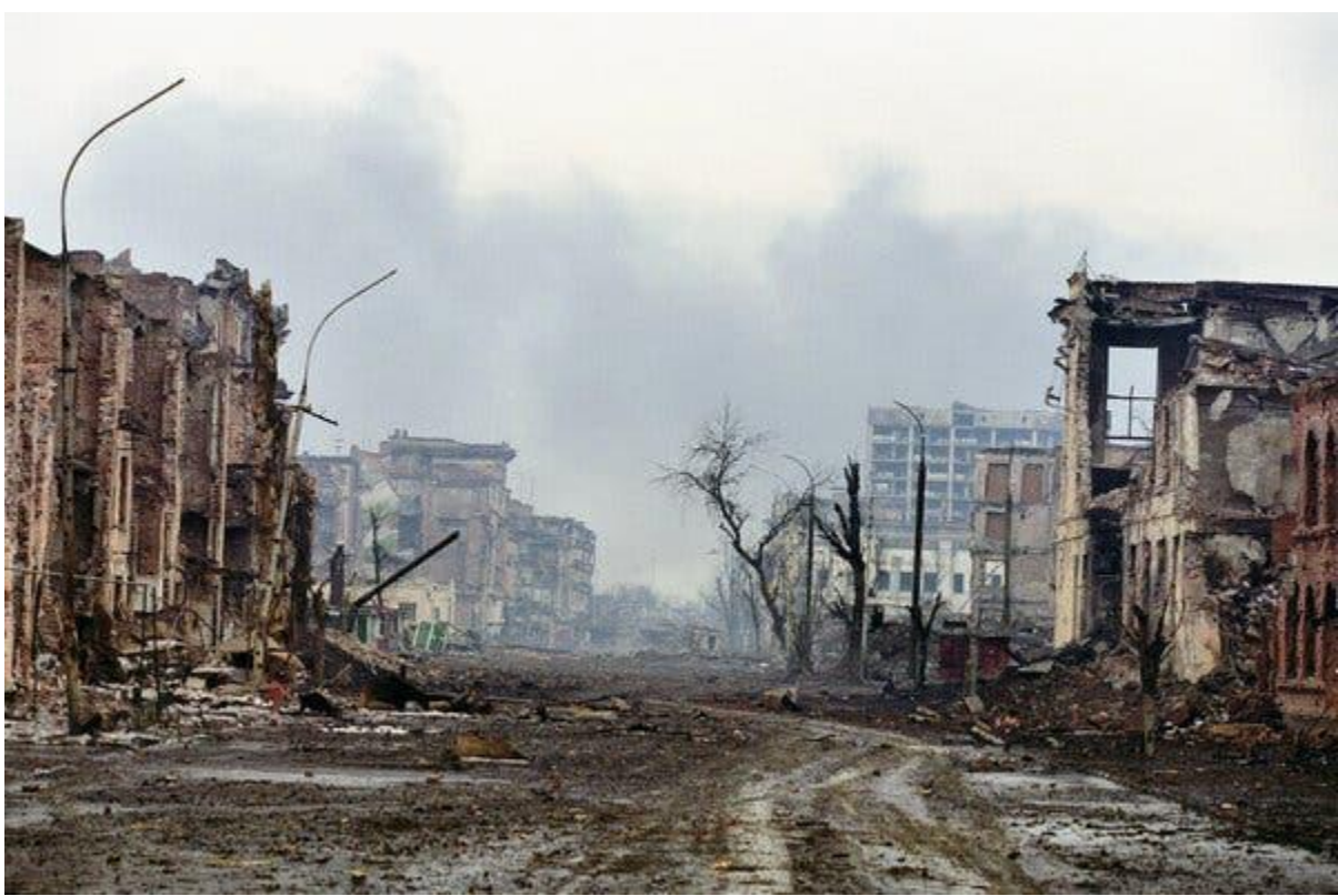
Grozny, Chechnya's capital, in 2000. Mr. Putin ordered the city razed to put down a separatist movement.