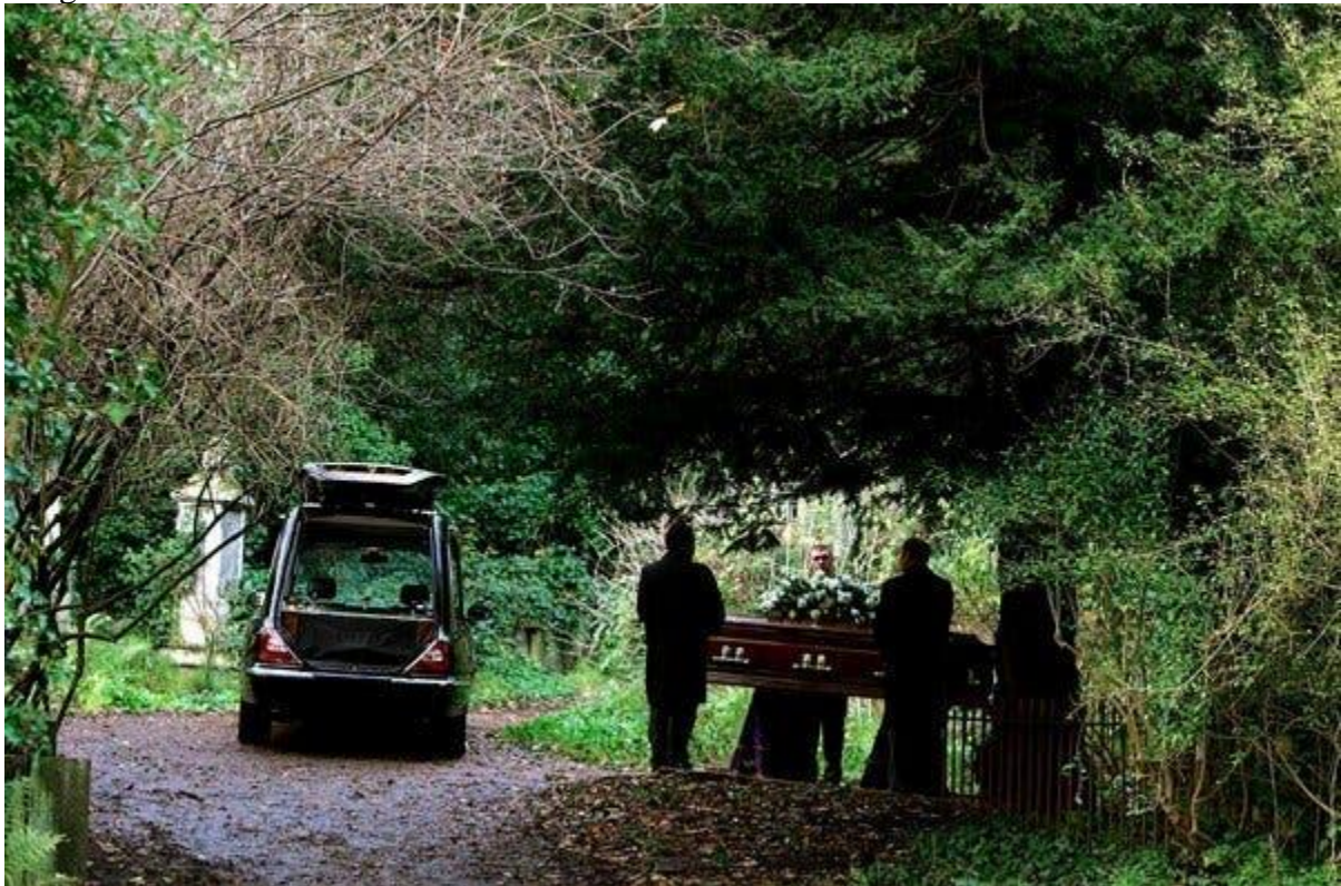
The funeral for Alexander Litvinenko, a former intelligence agent poisoned by Russian spies, in London in 2006.