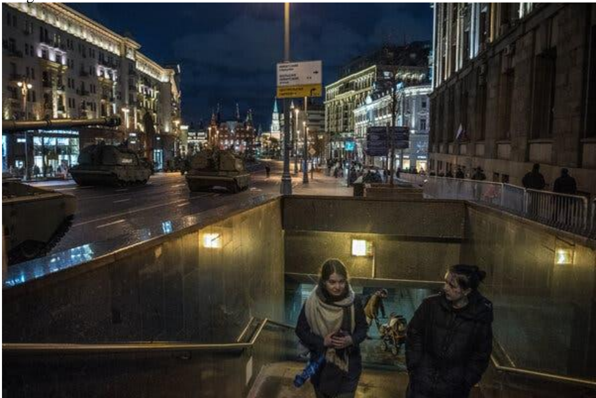
Armored vehicles in the streets of Moscow last May in preparation for Victory Day, which commemorates the defeat of Nazi Germany.