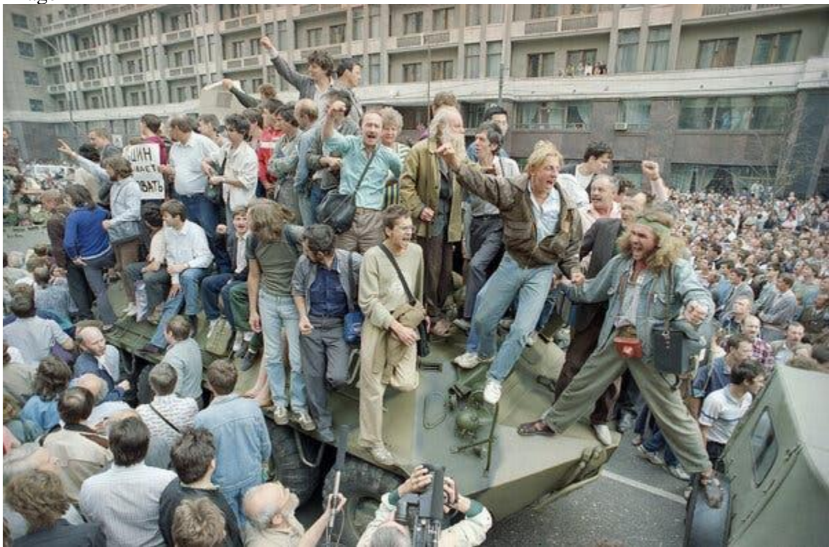
Protesters climbed onto tanks in Moscow in August 1991 after Mikhail Gorbachev, the Soviet leader, was briefly removed from power by hardliners.