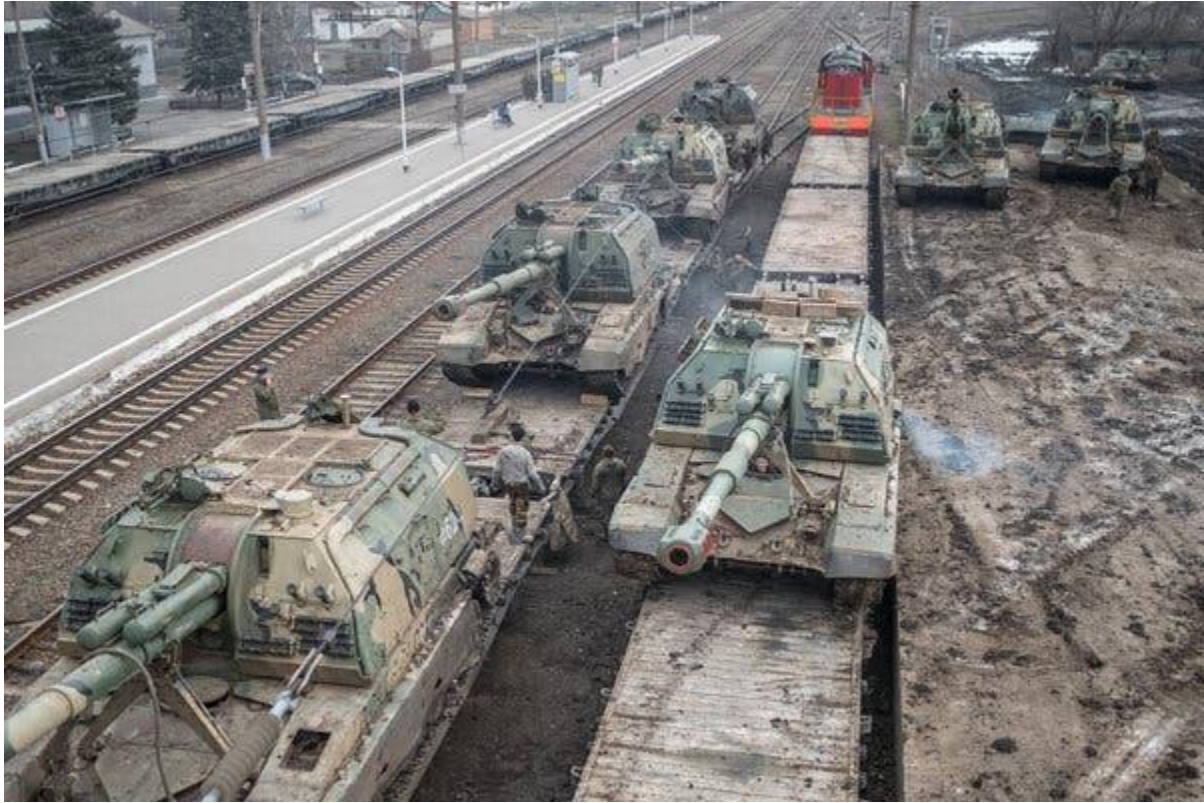
Self-propelled Russian howitzers being loaded onto a train car outside Taganrog, Russia, two days before the invasion of Ukraine.