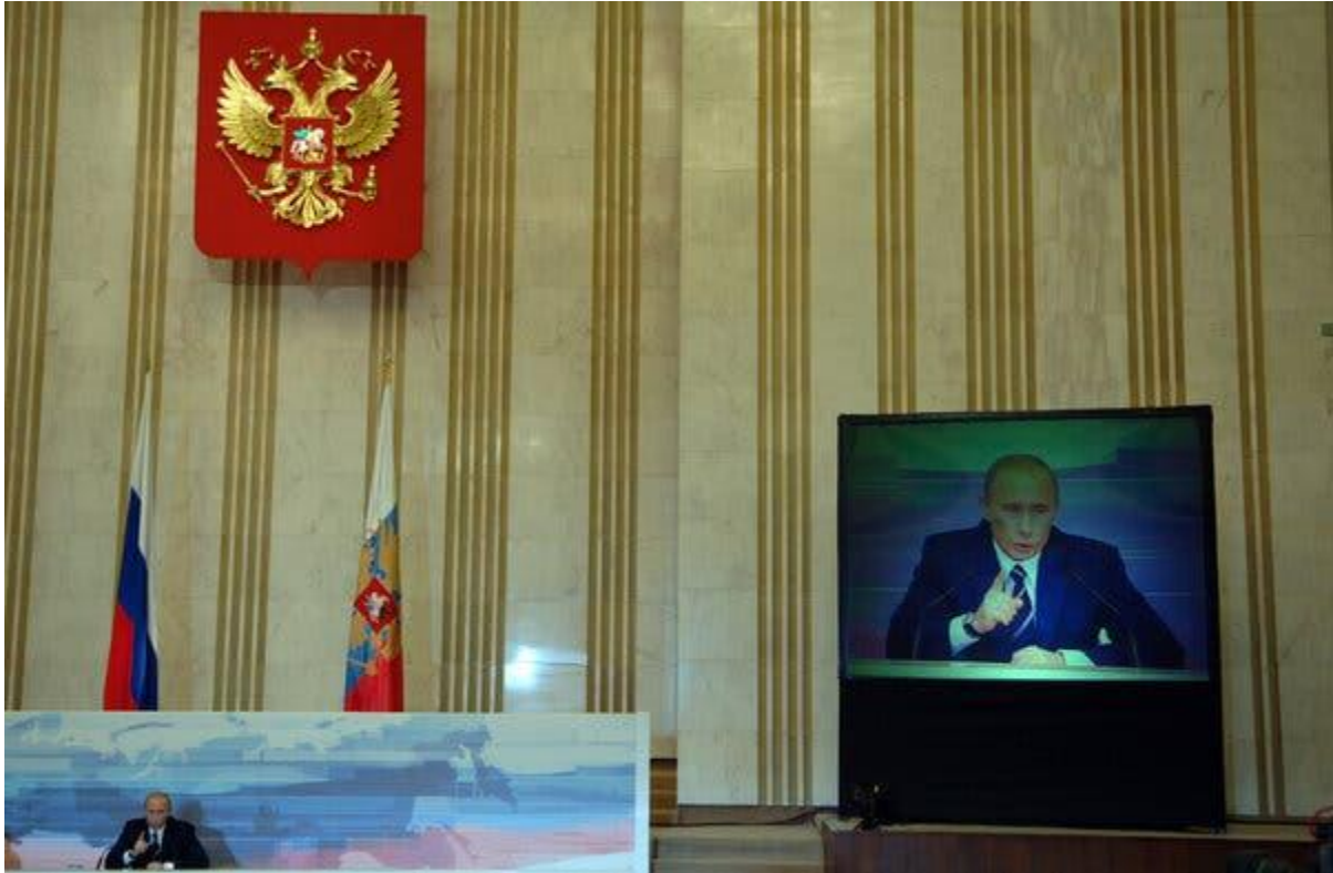
Mr. Putin in February 2007. In a speech to the Munich Security Conference that month, he complained of a “unipolar world” dominated by the United States.